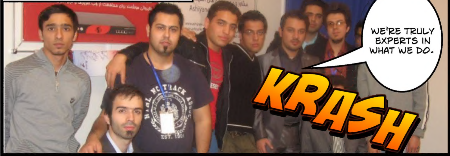
MEANWHILE AT IRAN'S ASHIYANE DIGITAL SECURITY TEAM HQ---